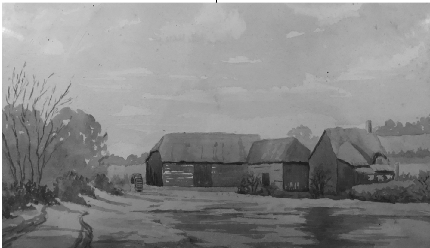
An early painting of River Barn Farm

While most of the old farmhouse is still with the 1632 timber frame the north gable, adjacent to Brocks Lane, is in brick! We assume that this end of the house collapsed at some stage and was rebuilt in brick; as part of this rebuild the roof was raised to give clear headroom in the bedroom at this end of the house. As can be seen in the old painting, the farmhouse originally had a thatched roof which was replaced in 1938 with thin fibre-based tiles. We recently replaced the fibre tiles with new hand-made clay tiles and found on the backs of two of the old tiles were the words "April 20 th 1938, A. W. Millson, W. Chappel" and "J. Marshall, L. Hissey (21 today), B. Carden, January" respectively, written in pencil. The part of the second tile with the year is missing but we assume that it was also 1938 and that this part of the roof was installed in two tranches, one in January and one in April by two separate teams. We wonder whether this could have been due to poor weather, lack of funds or some kind of disagreement with the first team!!! Both of the inscribed tiles are grey as were half of the old tiles while the other half were red, which further implies that the roof was put up in sections, maybe with whatever tiles were in stock at the time at the building material suppliers.