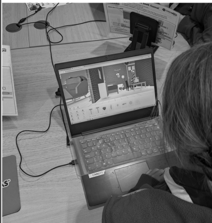
Guides at Code Ninjas

1st Bucklebury Guides and Rangers had a busy end of 2023. In November we visited Code Ninjas in Newbury where the Guides and Rangers got to have a go at coding their own