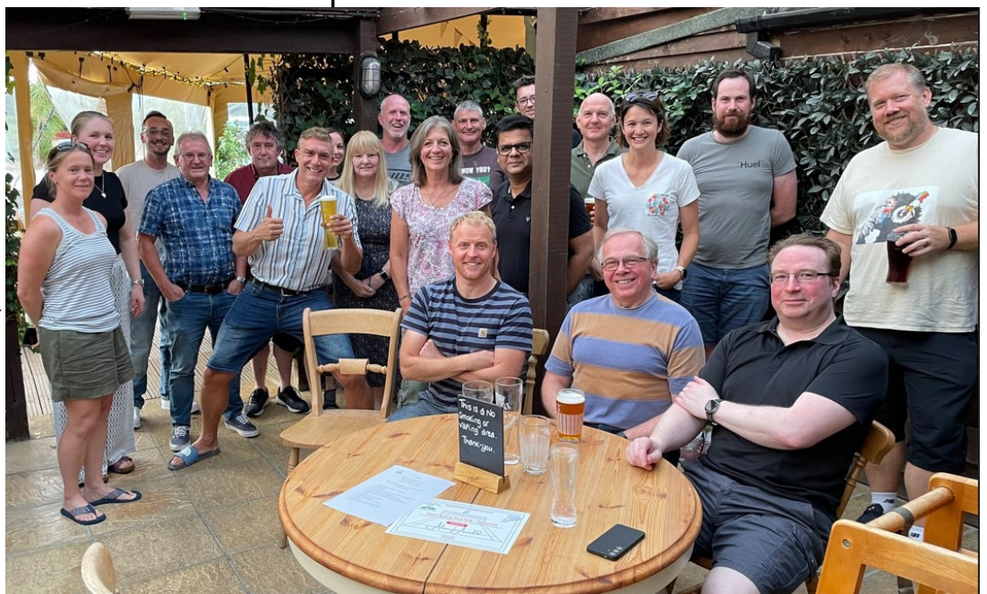
Members at the Bucklebury Badminton Club AGM