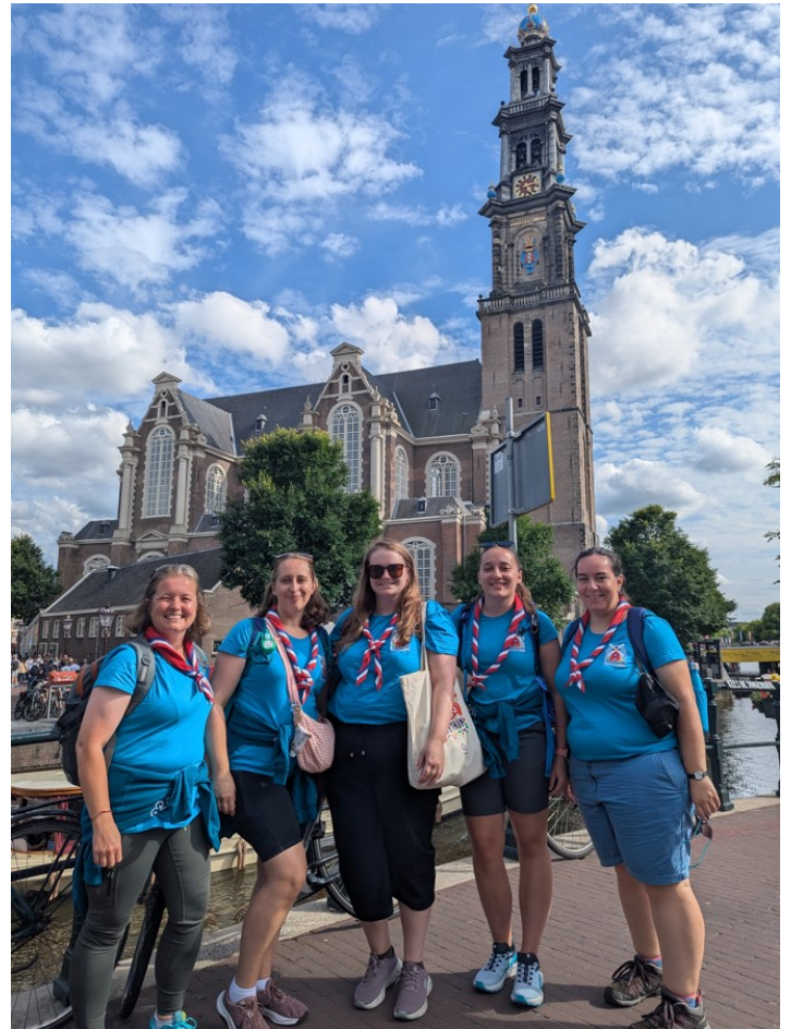
The leadership team exploring Amsterdam.

On our first day we travelled into Amsterdam by train and went on a canal cruise. The group saw all the main sites in Amsterdam including the iconic canals, and learnt about the culture and history as we travelled. In the afternoon we walked through the city centre to the Anne Frank Museum where we had an educational workshop before visiting the museum. To finish the day we stopped for a freshly cooked Stroopwafel on our way back to the station!