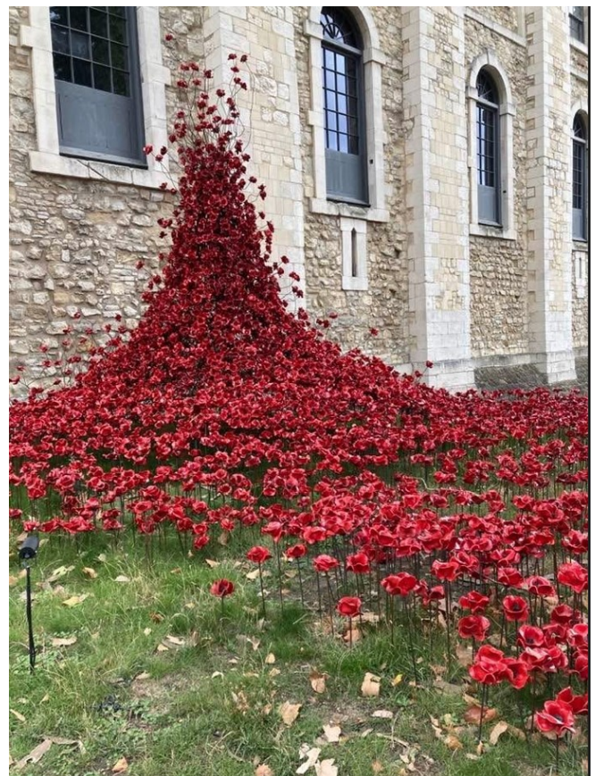
Poppies at the Tower of London