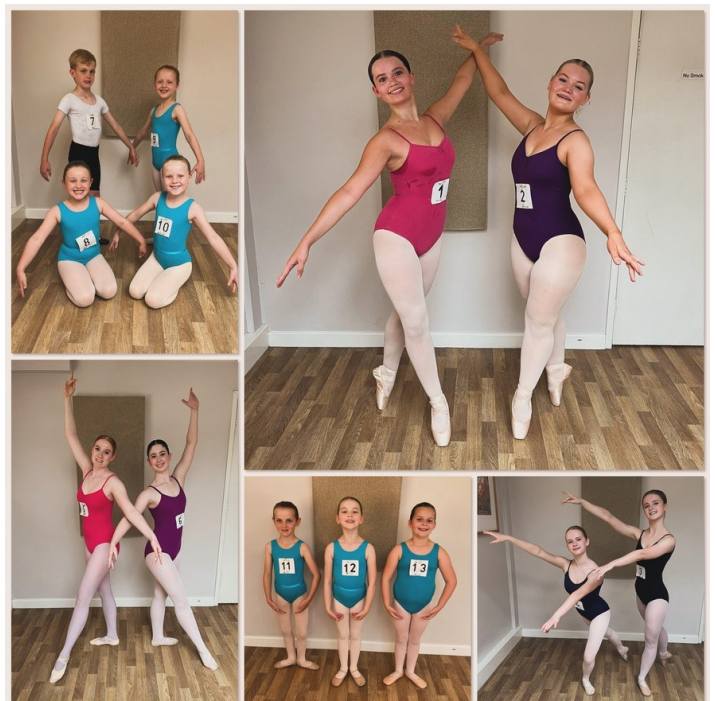
WBBS Students on exam day.

https://www.westberkshireballetschool.com/